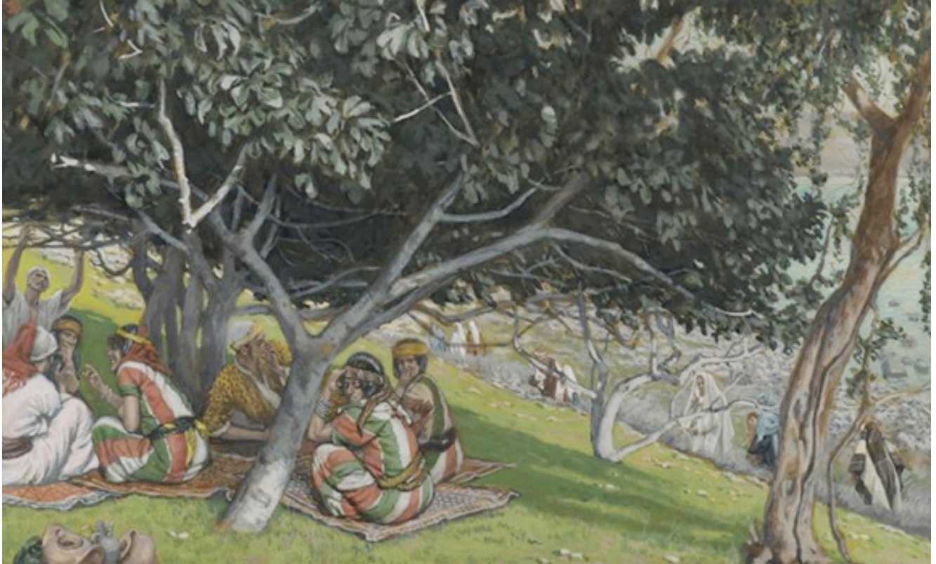
“Nathaniel under the Fig Tree,” James Tissot (1836-1902)