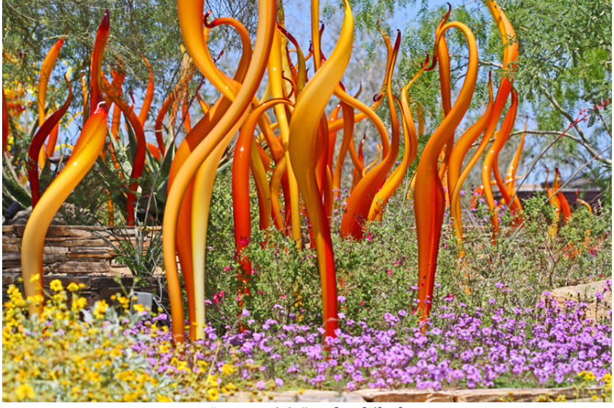
"New Spirit," Dale Chihuly