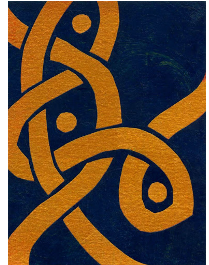
Tangled Up In You