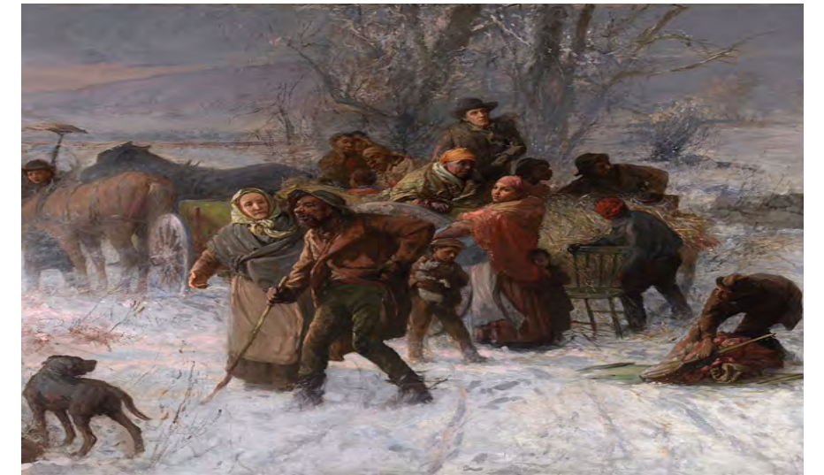
Underground Railroad, Charles T. Webber

616-456-1456 / westminstergr.org / Office Hours: Mon. - Thurs. 9:00 a.m. - 4:00 p.m.