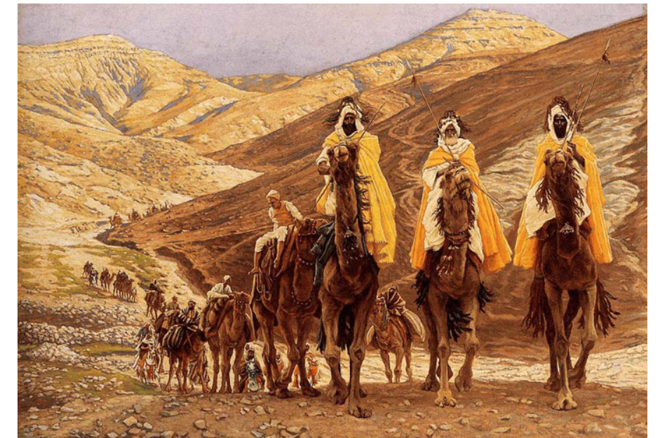
Journey of the Magi, James Tissot