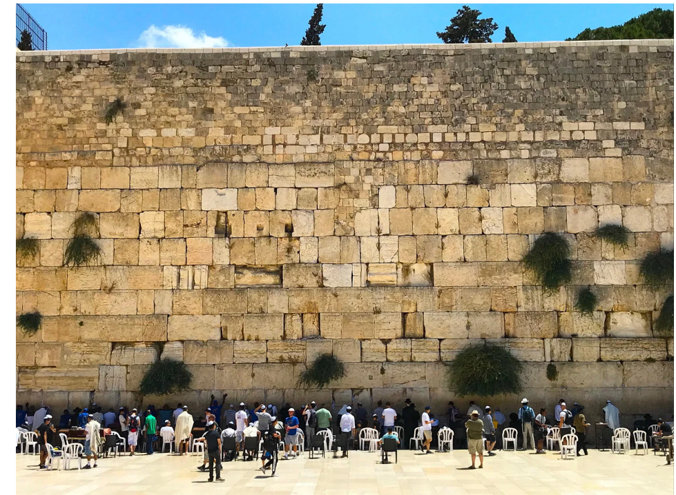
Western Wall in Jerusalem