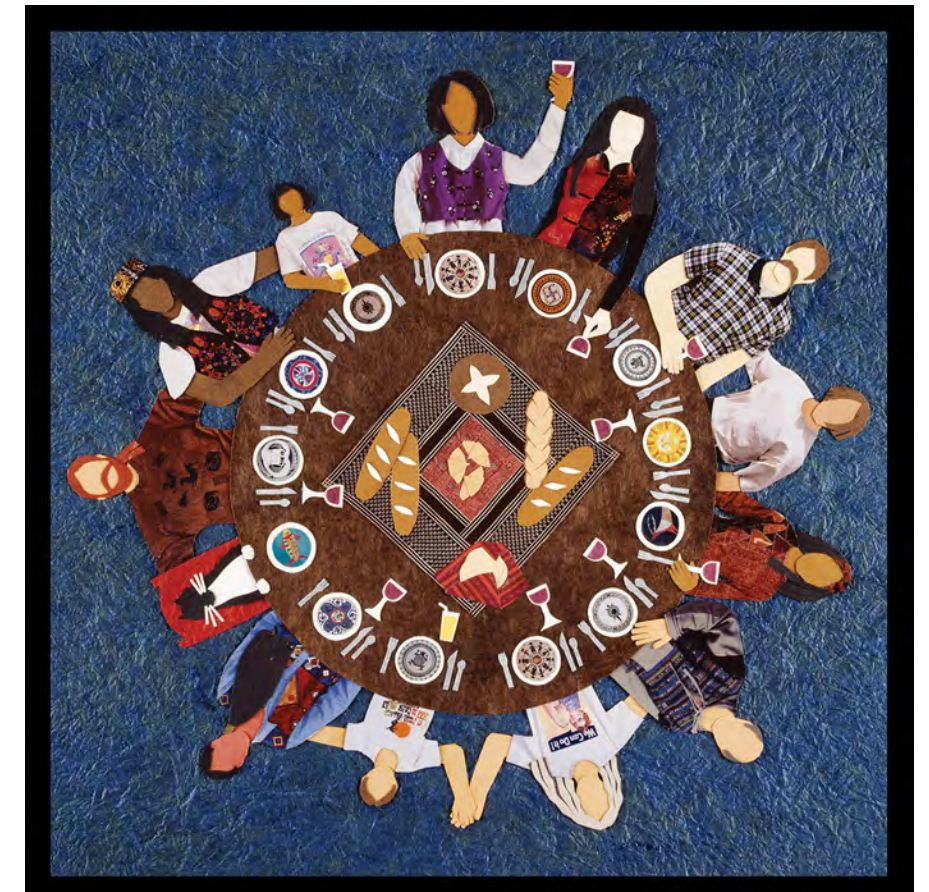
The Best Supper

As we welcome guests and visitors each week, we encourage everyone to personally extend the "Westminster Welcome" to those you have not met. Yours may be the welcome that truly helps all feel included.