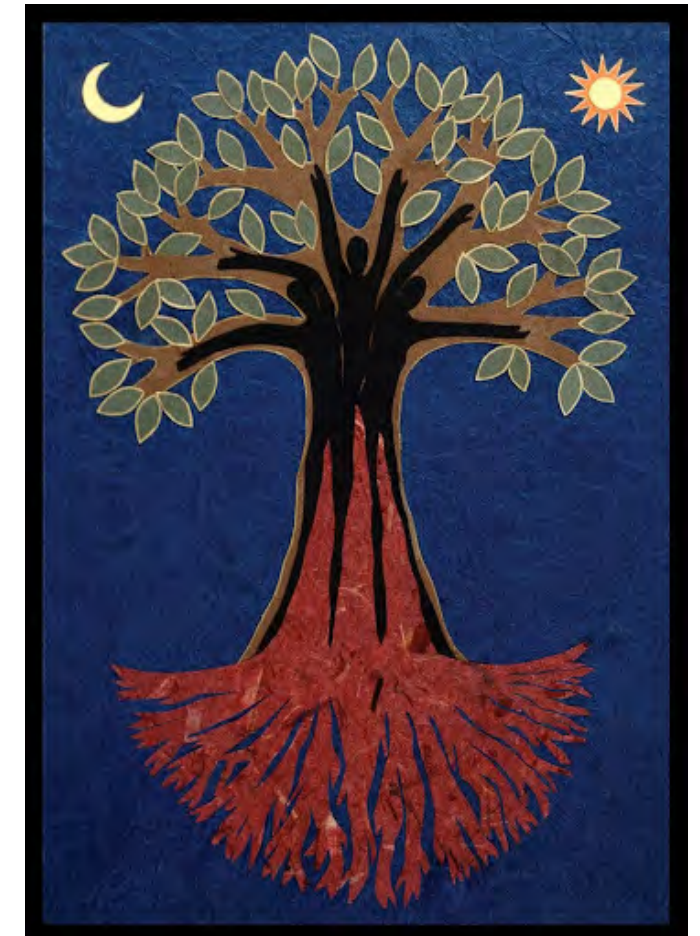
Mother Root