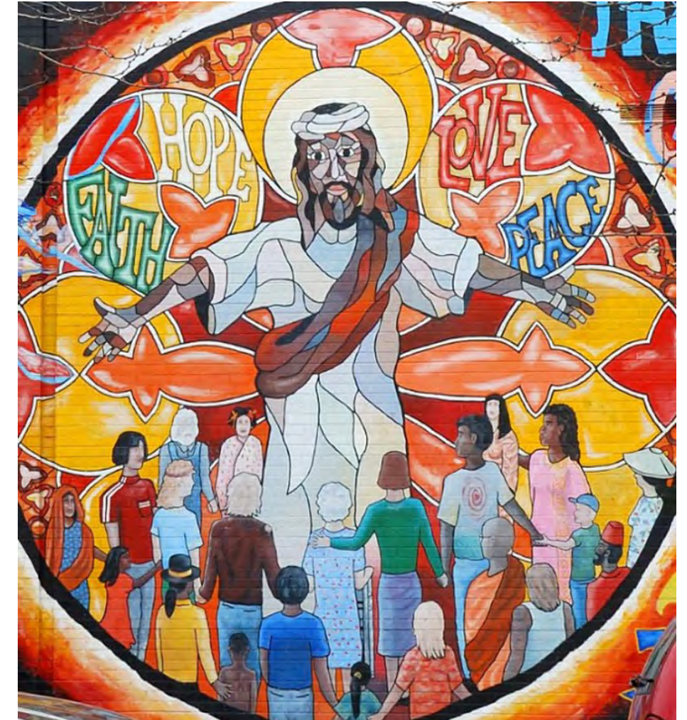
Jesus Mural of Faith, Hope, Love, and Peace, Chicago