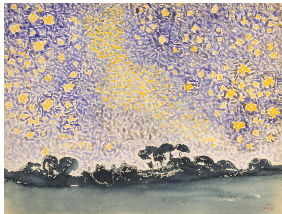
Landscape with Stars, Henri Edmond Cross