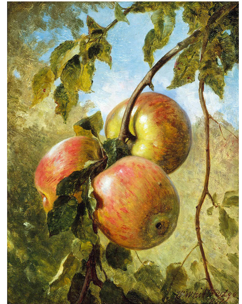
Apples, Worthington Whittredge