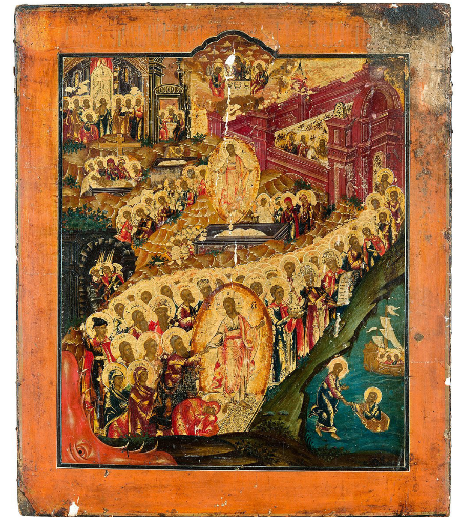
Resurrection of Christ and Descent into Hell Icon, Russia, 19th Century