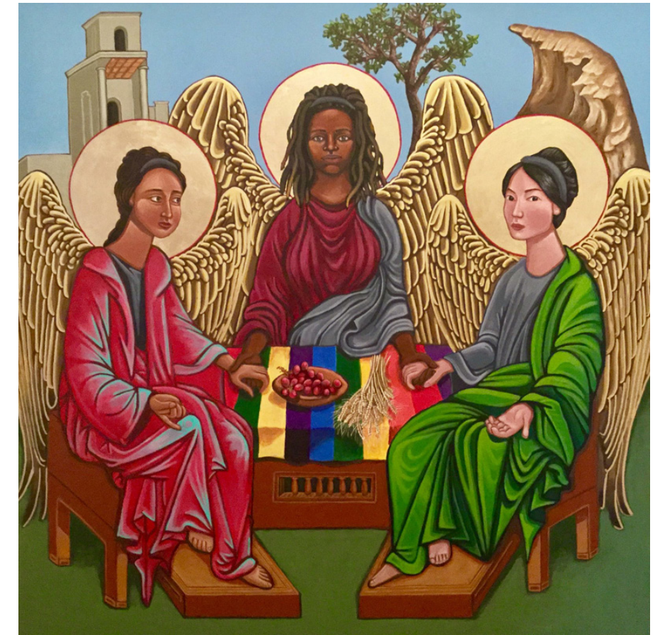
Trinity, Kelly Latimore