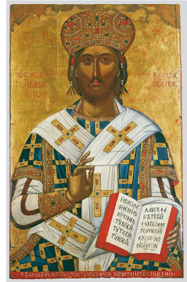
Icon of Christ the Great High Priest, 16th Century