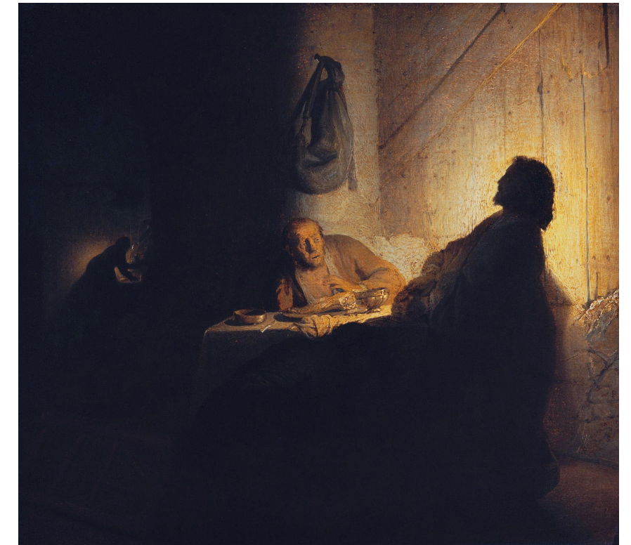
Supper at Emmaus, Rembrandt Harmenszoon van Rijn