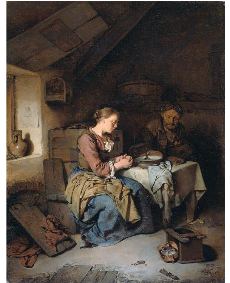
Saying Grace, Cornelis Pietersz Bega