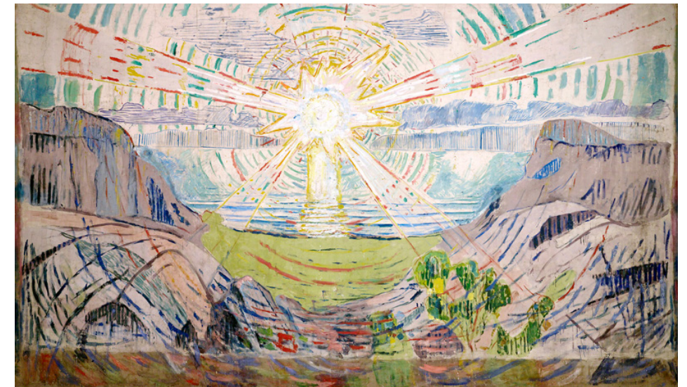
Sun, Edvard Munch